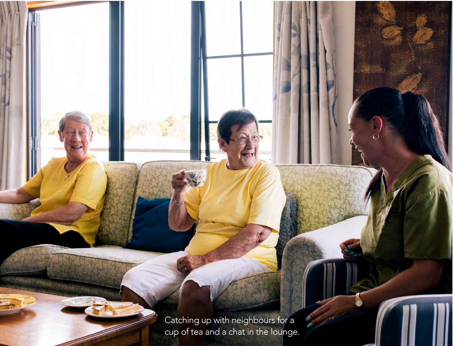
Catching up with neighbours for a cup of tea and a chat in the lounge.

At some stage in our lives we may require more assistance in our day to day living. We can offer the added peace of mind of an adjoining rest home and hospital complex should the need arise.